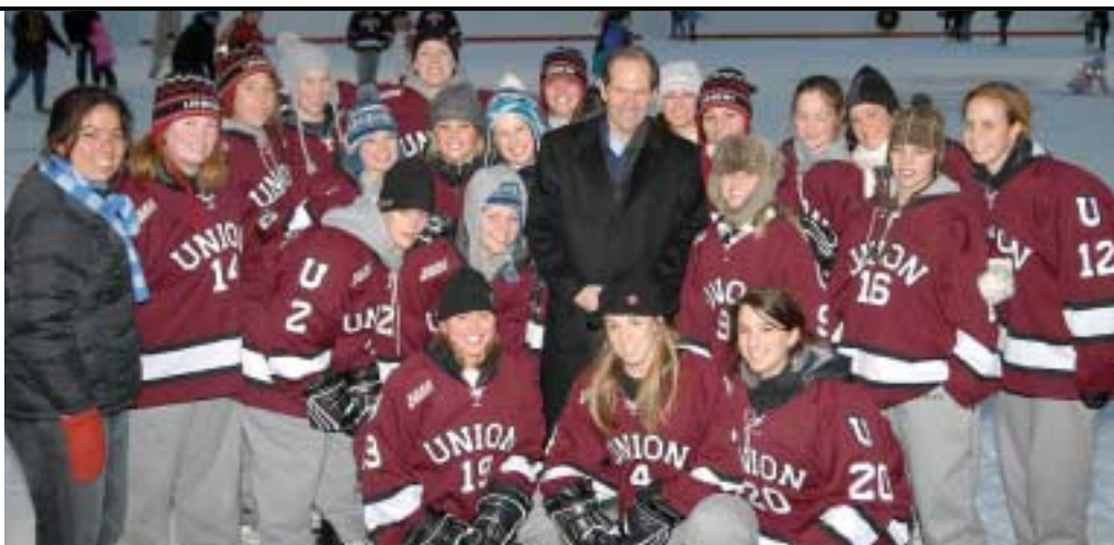
New York State Governor Eliot Spitzer with the Union College Women's Hockey Team at the Empire State Plaza 2007 Holiday Tree Lighting Festival